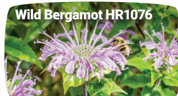
Wild Bergamot HR1076