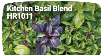
Kitchen Basil Blend HR1011

Each seed packet sold will earn you 40% profit off the packet price.