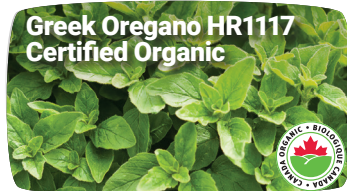
Greek Oregano HR1117 Certified Organic