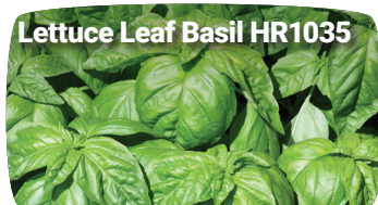
Lettuce Leaf Basil HR1035