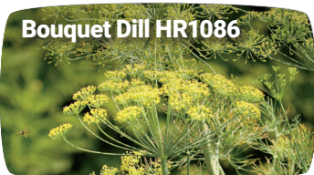
Bouquet Dill HR1086