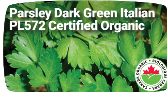
Parsley Dark Green Italian PL572 Certified Organic