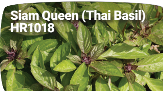
Siam Queen (Thai Basil) HR1018