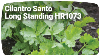
Cilantro Santo Long Standing HR1073